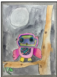
By Violet, 1st Grade