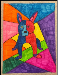
By Bellamy, 3rd