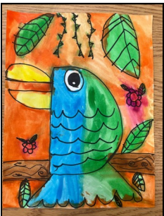
By Greyson, Kinder

Check out the picture below to see these projects!